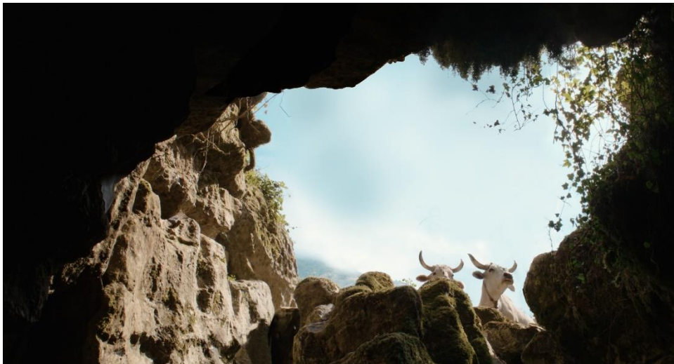
›Il Buco‹

›Il Buco‹ wins the €30,000 International Newcomer Award +++ Rainer Werner Fassbinder Award for Best Screenplay goes to ›Zero Fucks Given‹ +++ ›The First Fallen‹ receives the Award of the Student Jury +++